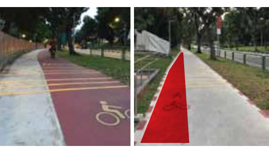
Figure 3: Use the pedestrian walkway whenever possible

Figure 4: Keep to the sides for a shared walkway (as shown by red box) whenever possible