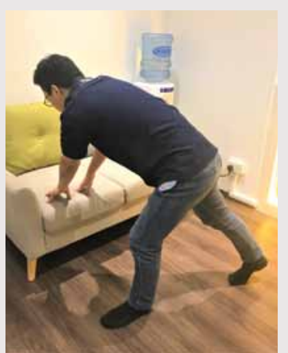
4. Push yourself up and slowly turn yourself around to sit down.