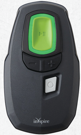
Inspire Sleep Remote

Inspire works inside your body while you sleep. It is a small device placed during a same-day, outpatient procedure. When you are ready for bed, simply click the remote to turn Inspire on. While you sleep, Inspire opens your airway, allowing you to breathe normally and sleep peacefully.