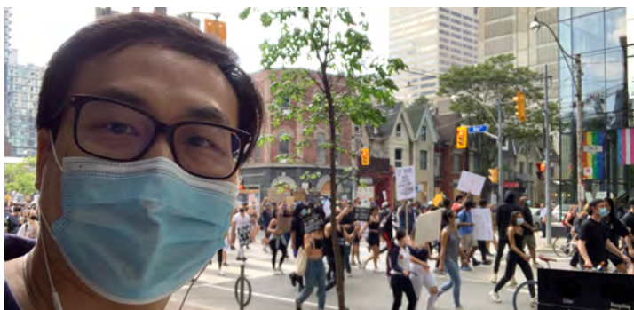
As 'Black Lives Matter' protesters march on, so does the lung transplant fellow marching to the hospital- the work is never done.

Measures were taken to safeguard the staff, our immune-suppressed lung transplant patients in the wards, community/rehabilitation hospitals and the community at large. Our transplant patients were followed up very attentively and they would come for the slightest hint of a cough or a cold. However, this model of care was no longer sustainable in COVID. Access to bronchoscopy or any aerosol generating procedures like a simple spirometry in the clinic had to be reviewed. The world we knew seemed to have altered forever.