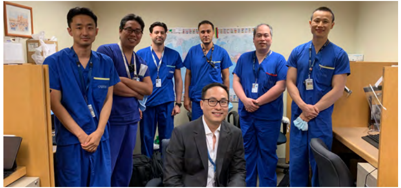
Passing the baton to the current and new lung transplant surgical fellows, future lung transplant surgeons of the world- standing from left to right- Vancouver, Japan, Switzerland, Germany, Australia, and Chicago.

Many of our lung transplant patients on the waiting list were deteriorating, and the COVID numbers in Ontario seemed to be in control. The lung transplant programme reopened carefully and gradually. Every case had to be discussed in the multidisciplinary board prior to listing and only urgent cases could proceed. Initially, donor retrievals were limited from within Ontario and later, extended to the rest of Canada except Quebec. At one time, Quebec had one of the highest numbers of COVID cases. Subsequently, we opened the programme to the whole of Canada but not USA (which we went to before the pandemic).