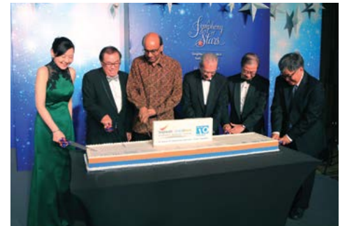
Leaders of SingHealth and Duke-NUS cutting the cake to celebrate 10 successful years of Academic Medicine partnership

Themed 'A Symphony of Stars', the Gala Dinner brought together clinicians, researchers, educators and donors who share a strong conviction to improve health outcomes and quality of life for patients and the community. DPM Tharman witnessed cheque presentations from three major donors (see below, pages 2 and 3) to various Academic Clinical Programmes (ACPs), which are platforms for collaboration across different institutions. The presentation of the final cheque for the $30.5 million raised