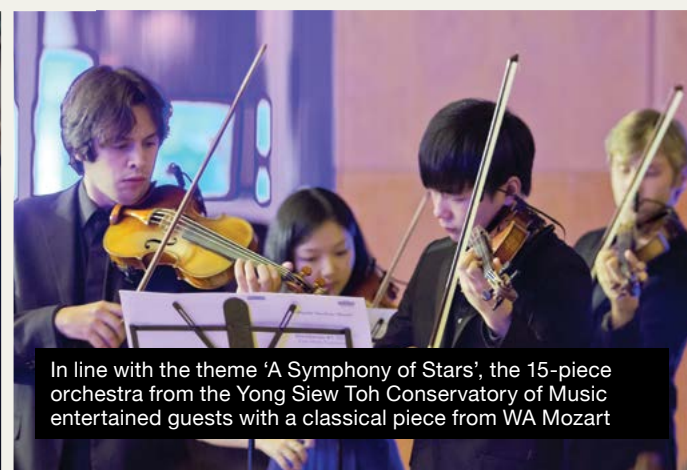
In line with the theme 'A Symphony of Stars', the 15-piece orchestra from the Yong Siew Toh Conservatory of Music entertained guests with a classical piece from WA Mozart