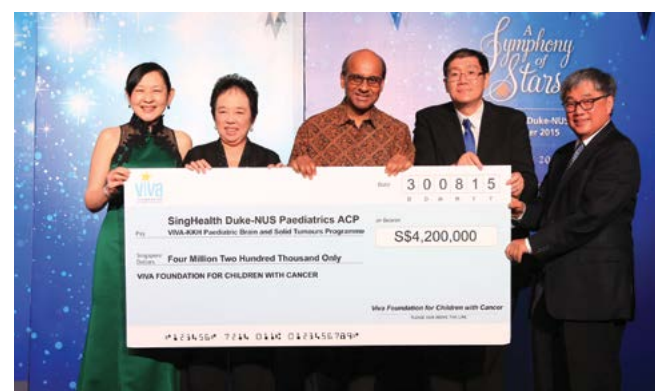
3) Prevention, control and population-based science

This collaboration will elevate the level of clinical care, translational research and population science for childhood brain and solid tumours in Singapore. By integrating current expertise in Singapore and beyond into focused programmatic efforts, it will advance treatments and care to benefit many more children in the future.