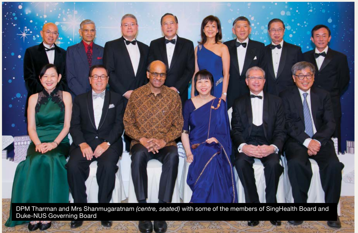
DPM Tharman and Mrs Shanmugaratnam (centre, seated) with some of the members of SingHealth Board and Duke-NUS Governing Board