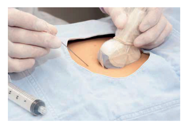
Figure 1 Picture showing amniocentesis procedure done under ultrasound guidance.

Both amniocentesis and CVS are done under guidance of an ultrasound. During amniocentesis , a small amount of amniotic fluid surrounding the baby is drawn through a small needle that is inserted through your abdomen. This is typically done after 16 weeks of pregnancy. CVS , on the other hand, involves collecting small sample of tissue from the placenta by inserting a needle through the abdomen. CVS is typically done between 10 to 14 weeks of pregnancy.