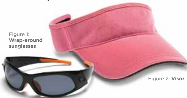
Figure 1: Wrap-around sunglasses