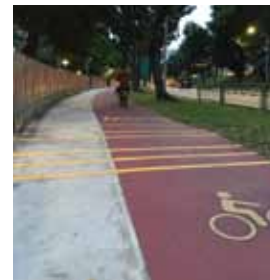
Figure 3: Use the pedestrian walkway whenever possible