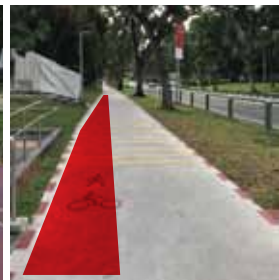
Figure 4: Keep to the sides for a shared walkway (as shown by red box) whenever possible