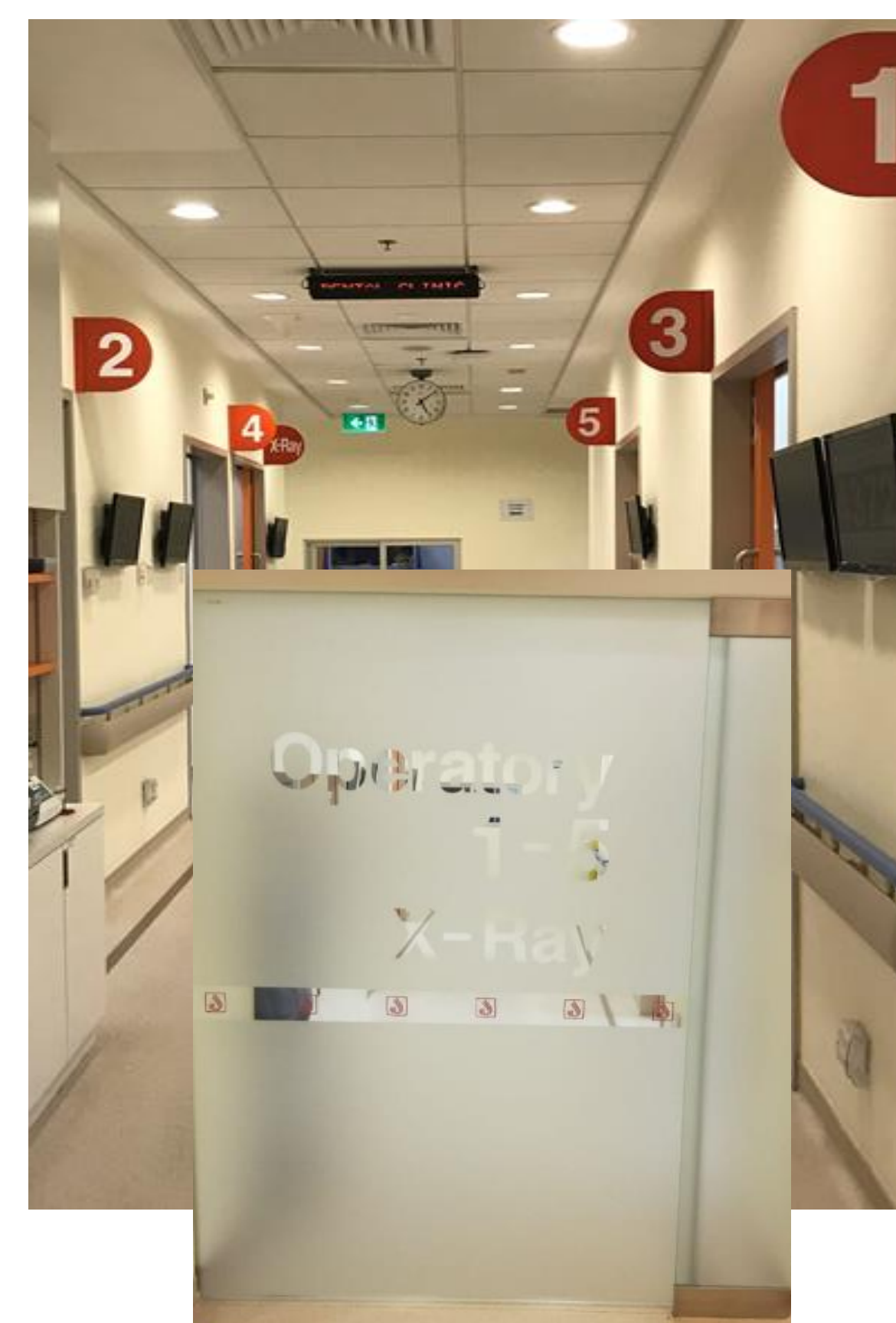
Pre-intervention Signage leading to treatment rooms